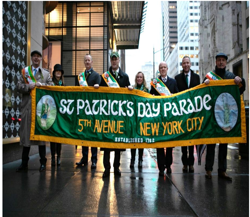
Although the parade was officially postponed, members of the St. Patrick's Day Parade Committee keep the tradition going by marching up Fifth Avenue.

The PMAAA Mass of Remembrance, however, will be held in conjunction with the PMAAA Annual Mixer at All Hallows High School in June 13 th , 2020. Given the current circumstances, though, this date may change.